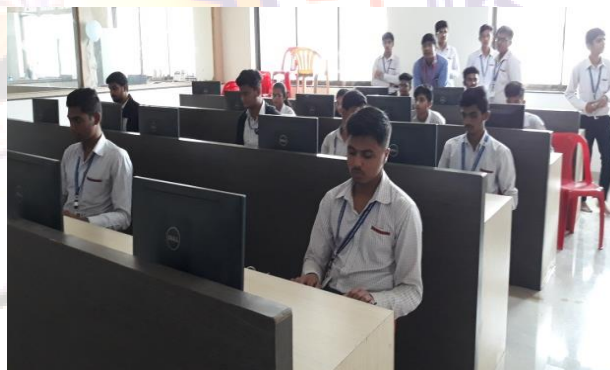
Participation of students in Blind C Competition.