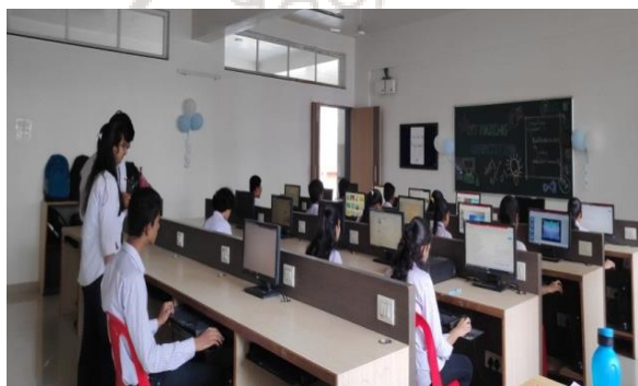
Participation of students in PPT Making Competition.