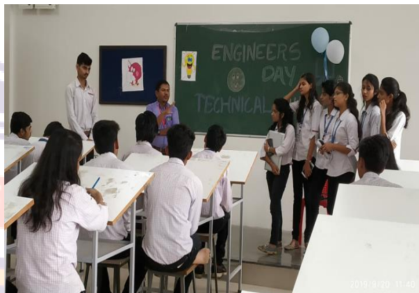
Participation of students in Quiz Competition.

Birthday anniversary of Sir M. Visvesvaraya was celebrated as Engineer's Day. Computer Dept has celebrated Engineer's Day with different activities like PPT making competition for first year student, Quiz Competition for second year student and Blind 'C' competition for third year student.