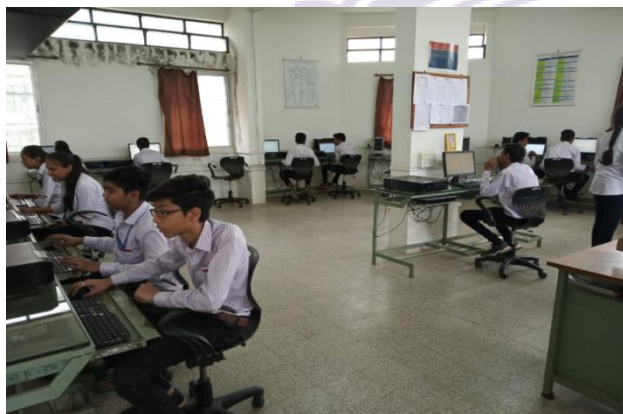
Participation of students in quiz competition.

Think-IT i.e. an Online Quiz Competition was conducted and the main aim behind this competition was to challenge and test student's technical and non-technical knowledge.