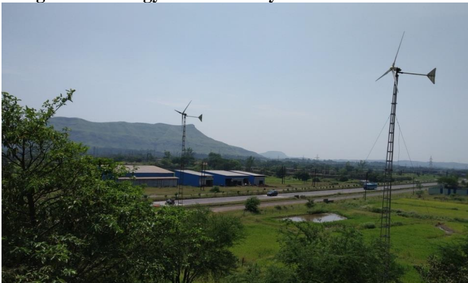
Fig. Photograph of wind miles energy generation device

The hybrid energy generation devices contain a solar panel and wind turbine. The hybrid energy generation device generates 15 units per day. The college is now using 15 kW UPS and batteries for energy storage