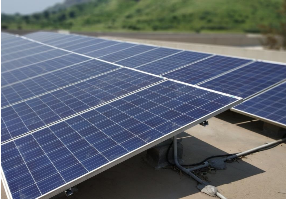
Fig- Solar Energy Generation system